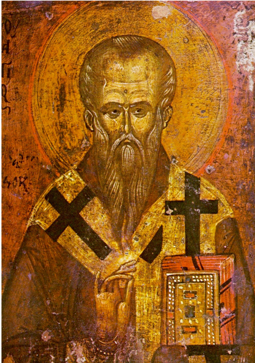
SAINT CLEMENT OF OCHRID