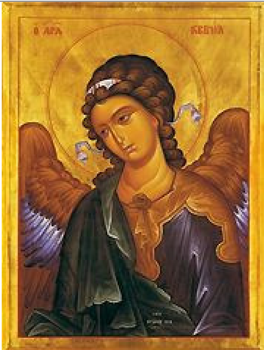
HOLY ARCHANGEL GABRIEL