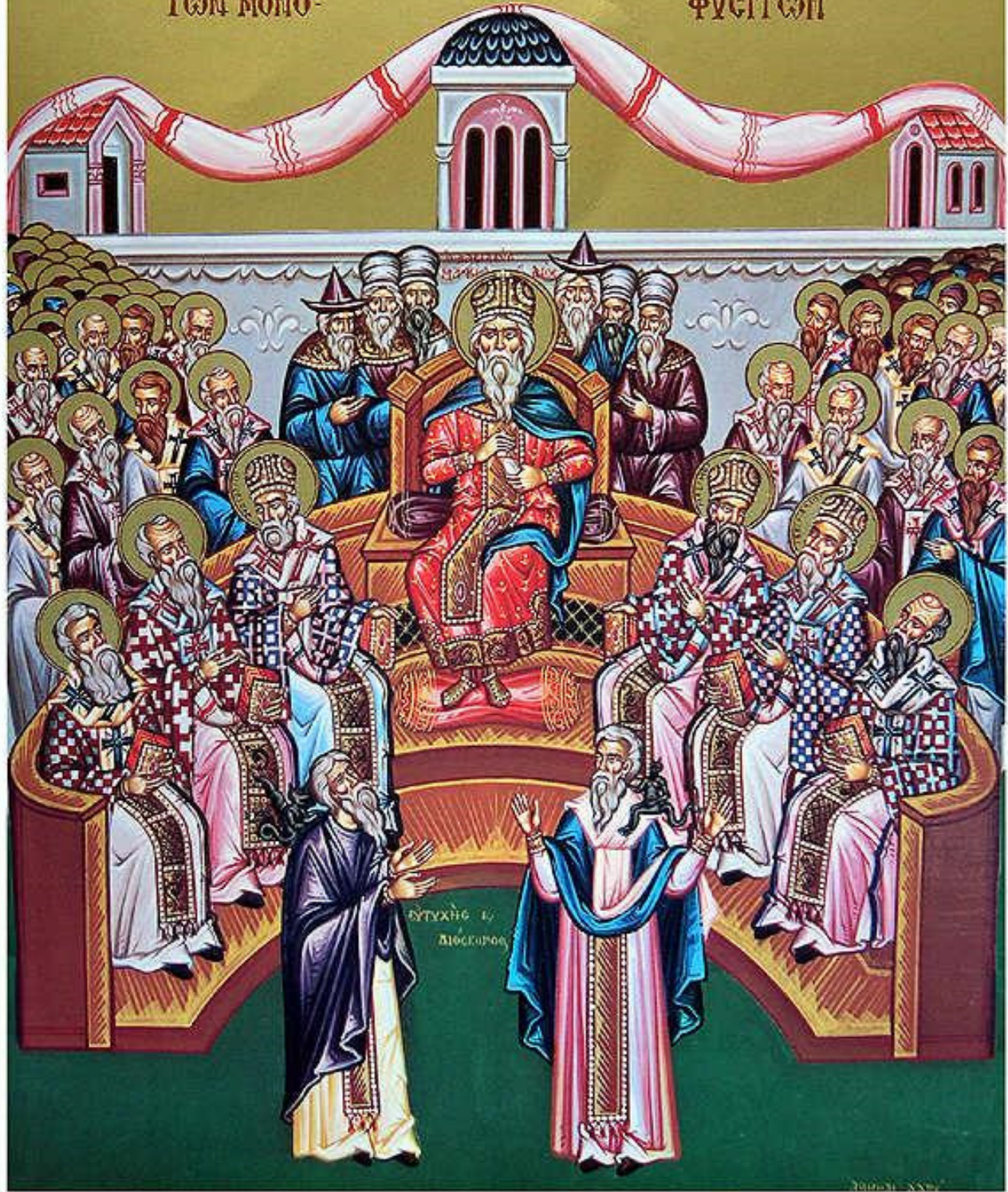
HOLY FATHERS OF THE FIRST 6 ECUMENICAL COUNCILS

ΜΕΝΙΚΗ ΣΥΝΟΔΟΣ ΜΑΡΚΙΑΝΟΥ ΒΑΣΙΛΕΥΣ ΕΠΙ ΕΤΕΙ 451 ΚΑΤΑ ΕΥΤΥΧΕΣ ΚΑΙ ΔΙΟΣΚΟΡΟΥ ΦΥΣΙΤΩΝ