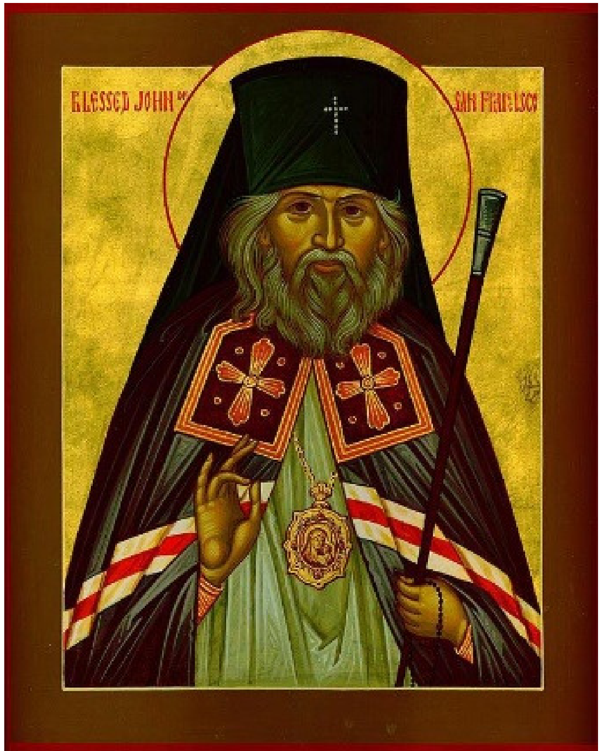
Our Father among the Saints John (Maximovitch) Archbishop of Shanghai and San Francisco (1896-1966)